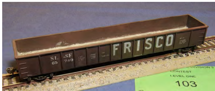
Third Place -- Jim Foster