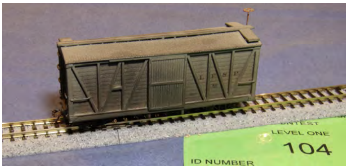
First Place -- Jim Foster