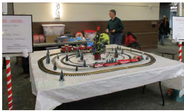
Christmas on Campus 2021