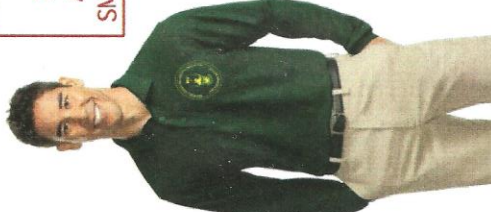
Green Polo (LS) * S to 4X $29