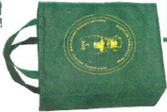
Large Tote Bag 15.5"H 13"W 7"D $14