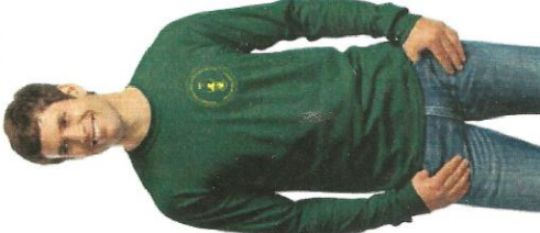
Green T-Shirt (LS) * S to 6X $20