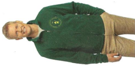
Zippered Fleece S to 4X $40