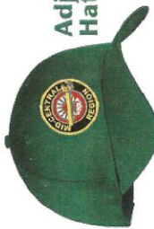
Adjustable Hat w MCR $16

Embroidery Option on Tote & Apron: Personalized with First Name $5 Personalized with First & Last Name $9 Personalized with Railroad Name: $12