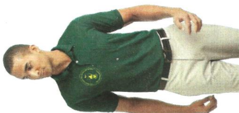
Green Polo * w pocket S to 4X $22