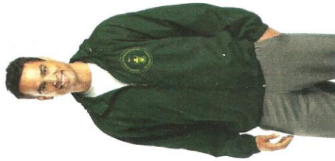
Windbreaker w hood S to 6X $36