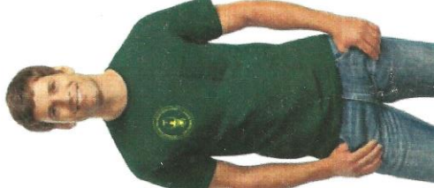
Green T-Shirt * w pocket S to 3X $18