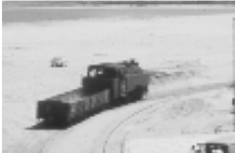
Steam on the docks. Mozambique, 1972