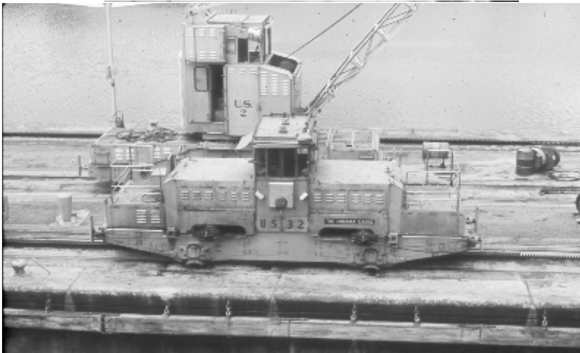
Panama Canal Mule and Crane, 1973