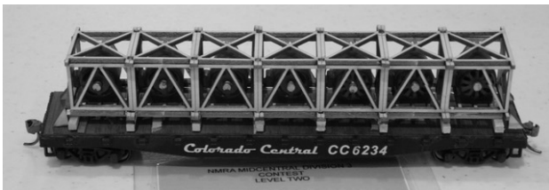
First Place - Level 2- Eric Zimmerman