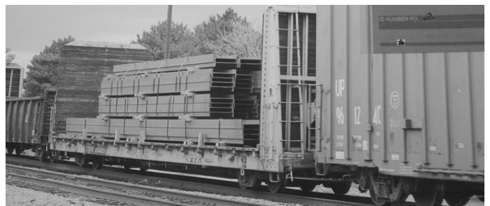
First Place - Photo - Nate Adams