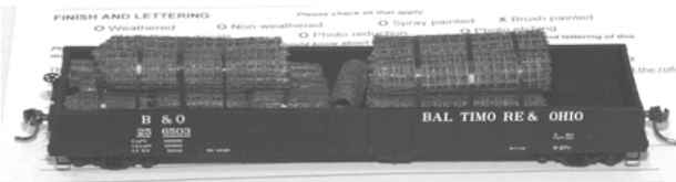
First Place - Level 3 - Gordon Carlson