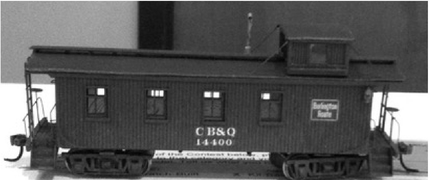
First Place - Level 2