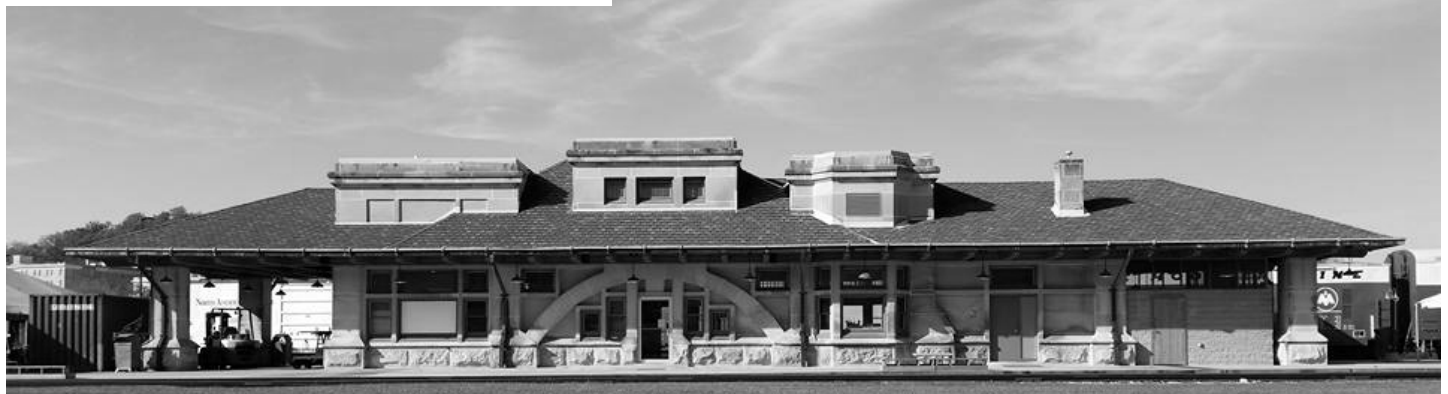
Monon Station, French Lick, Indiana