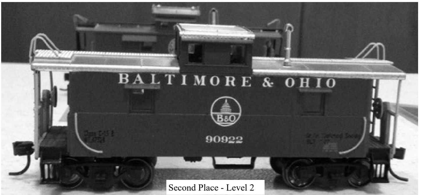
Second Place - Level 2