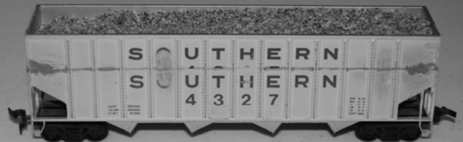
Second Place - Scratchbuilt