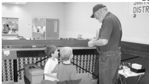
Training "DOG" Walkers