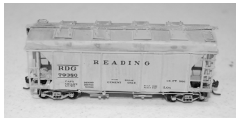
Scratchbuilt First Place