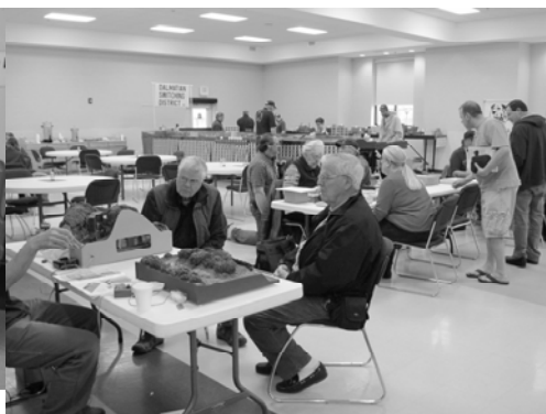
Have a question? We have Answers