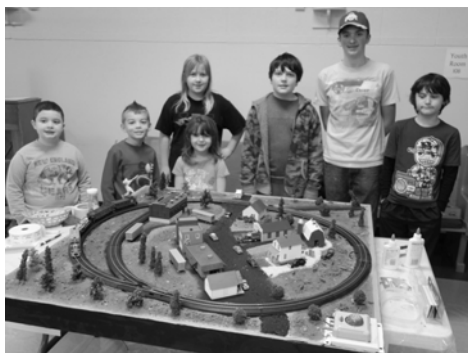
Layout Construction Gang

Lots of activities, lots of guests and lots of fun.