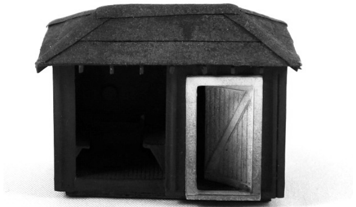
Level 2 Third Place