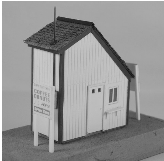
Level 3 First Place