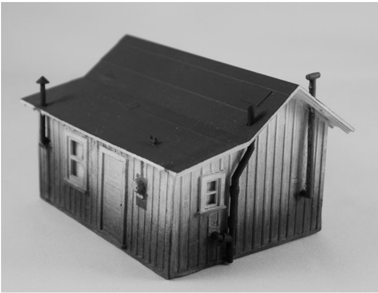
Level 1 First Place