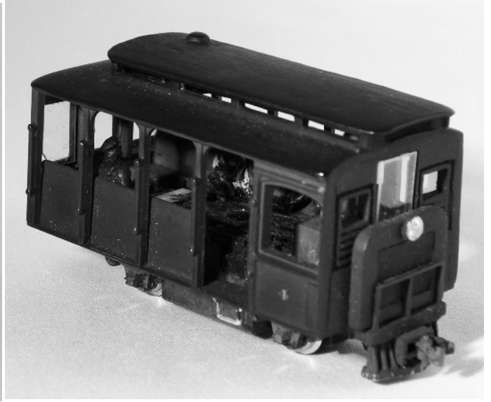
Level 2 First Place