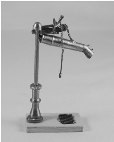
Level 2 Second Place