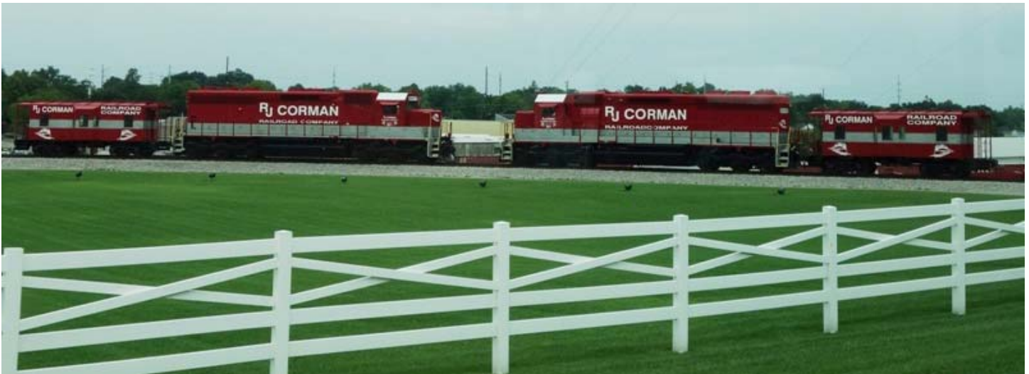
RJ Corman Sign