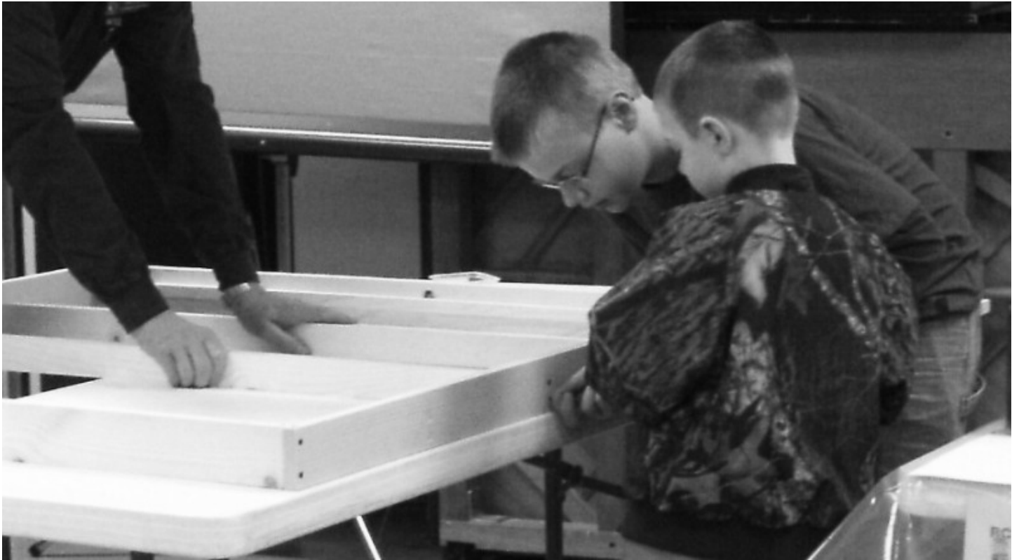
We started about 9:30 am and.....