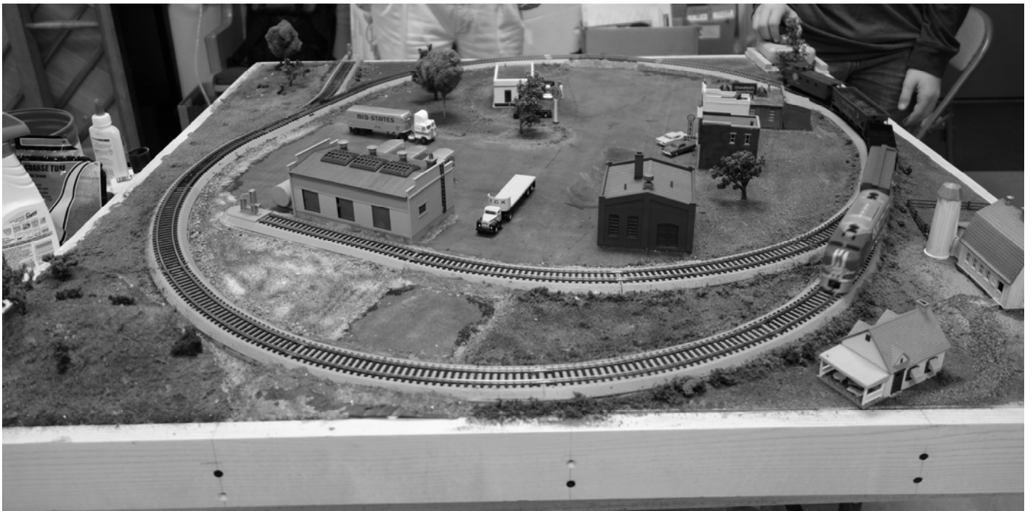
...were running the train at 3:30 pm and we took a break for lunch!