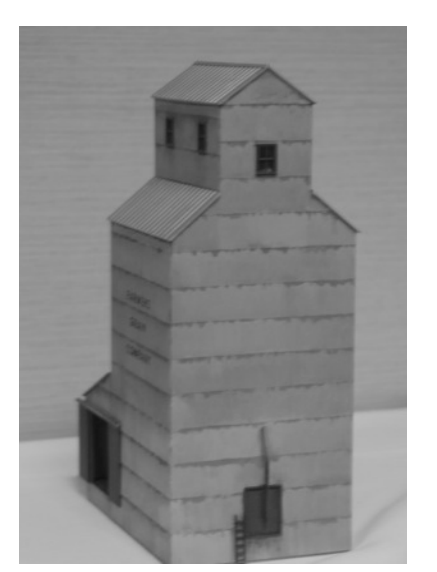
CONTEST RESULT FOR November 2013 WEATHERING