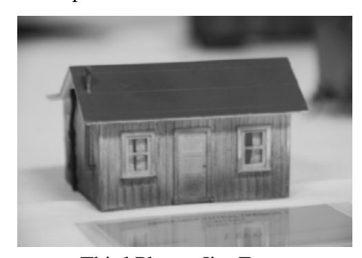
Third Place - Jim Foster