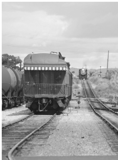
First Place Photo Ric Zimmerman