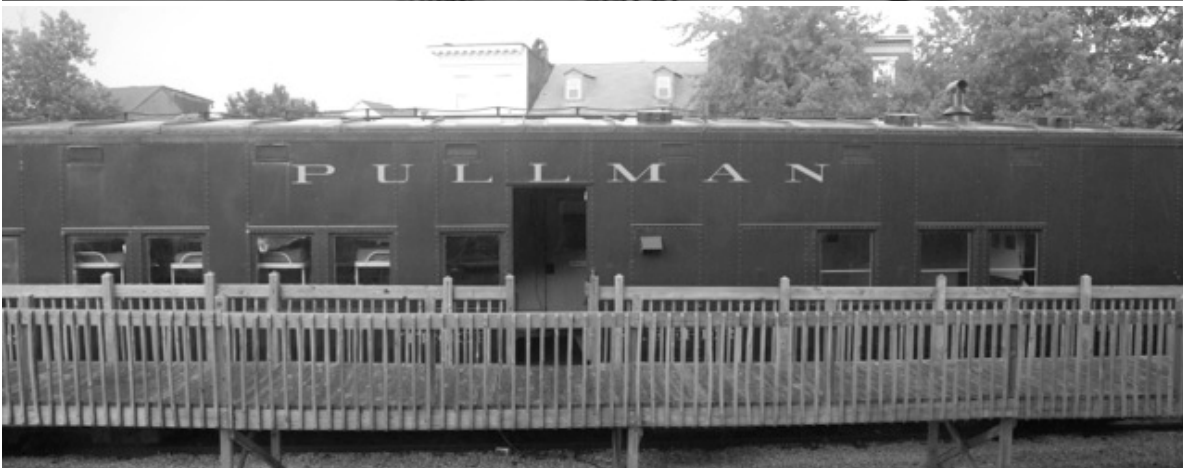
2nd Place Photo Ric Zimmerman