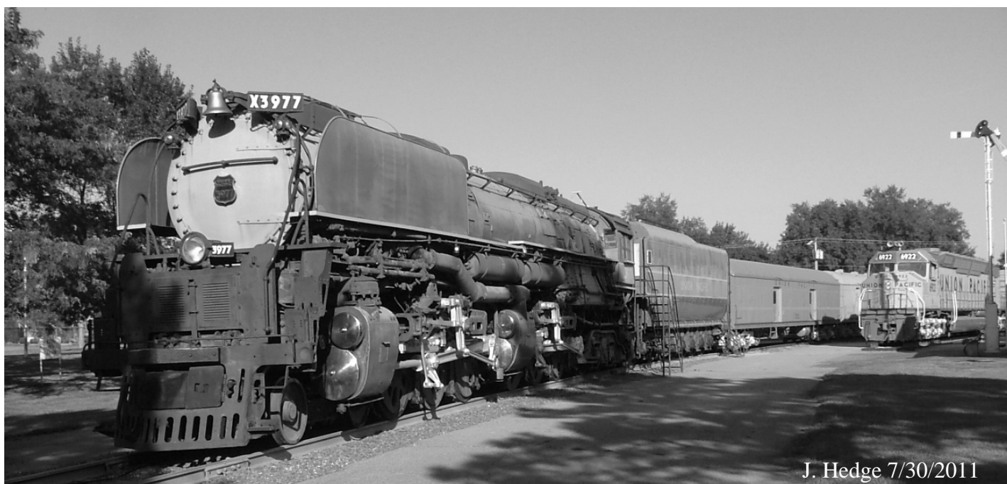
Union Pacific Challenger and DD-40 at North Platte, Nebraska

Repeat announcement: The Howell Day Museum is issuing a new release of its highly successful Gorre and Daphetid bobber cabooses. Two new bobbers, numbered 3 and 5, are available from Headquarters immediately. A single car is US$19.95 + $4 shipping and handling, and the set of two is US$34.95 + $4 shipping and handling. The new cars are available in HO scale only, and are ready to run. They feature operating magnetic knuckle couplers and free-rolling metal wheels. Watch for the ad running in NMRA Magazine. To order, call HQ at 423-892-2846.