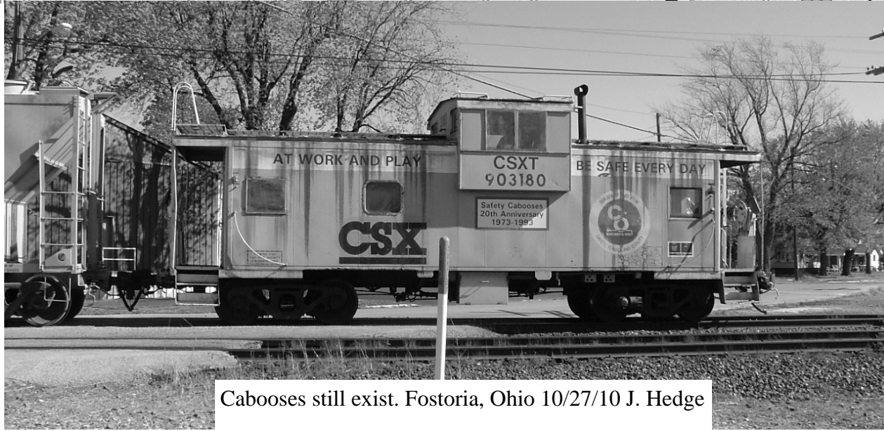
Caboose still exist. Fostoria, Ohio 10/27/10 J. Hedge