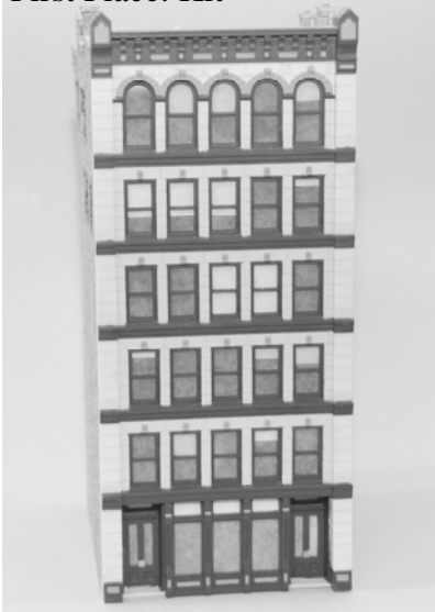
First Place: Kit