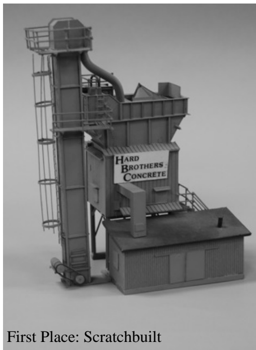
First Place: Scratchbuilt