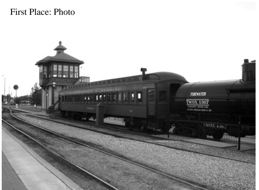
First Place: Photo